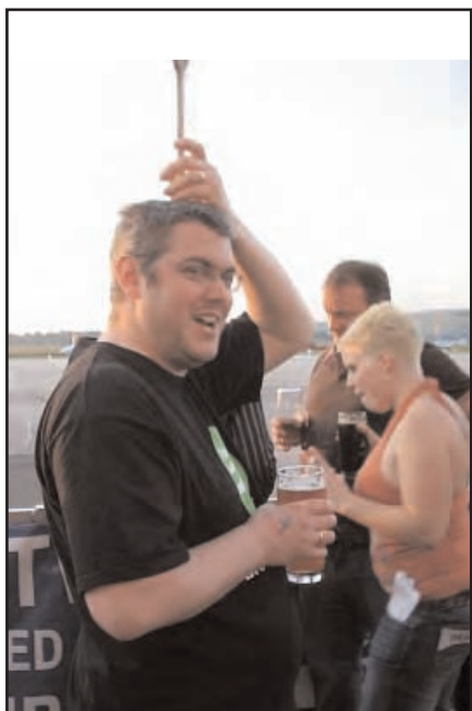
Calling the Beer Traffic Control Tower...