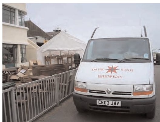
The first consignment of casks is about to be unloaded.

So, come 15th to 17th June, Coombes' population will more than quadruple for Glastonwick 2007 – which will feature 65 cask-conditioned ales, 10 Farmhouse ciders / perries, and 22 live bands, singer-