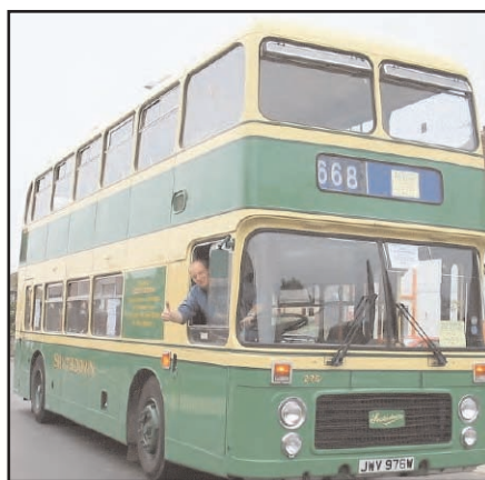
The shuttle bus is a classic too.

Approximately 60 miles south of Central London, and about 35 miles south of London Gatwick Airport. To get there by public transport (after the obvious Trans-Atlantic leg!), catch any train to Shoreham-by-Sea and transfer to the free Glastonwick shuttle bus (check times on the website).