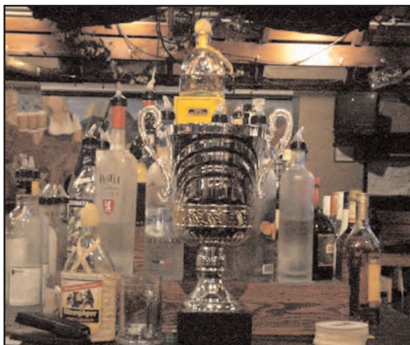
The F.X. Matt cup