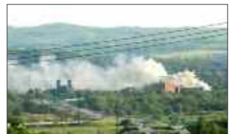
A view of the fire from the Mulaney Road Bridge.