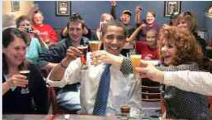
Barack Obama enjoying a craft beer at Bethlehem Beerworks. His thirst for new beer styles proved popular among younger drinkers and many other demographics, except middle-aged and older women (wine drinkers), and blue-collar workers (macro lagers, no “sissy” beers).