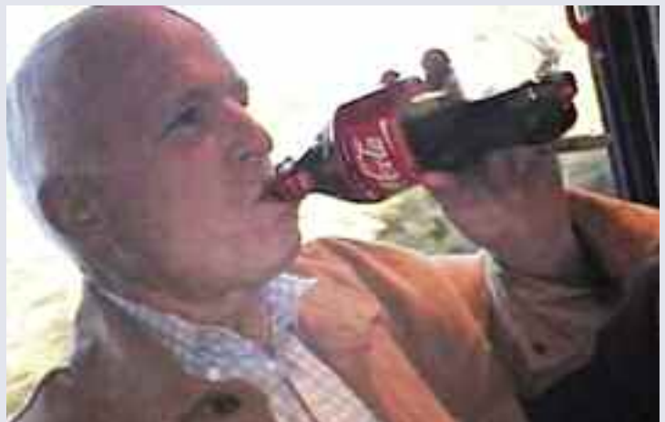
John McCain's wife, Cindy McCain, is a $100 million heiress and executive to the third largest Anheuser-Busch distributorship, yet this is the only photo I could find of him drinking anything. He will retain the status quo of accepting corporate brewery dollars, publicly avoiding all alcohol consumption, and keeping his true drinking habits a secret.