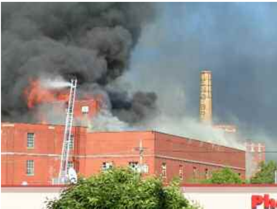
Hundreds people were at the brewery for a weekly beer, food and live music fest. Many attendees submitted their photos to NBC-WKTV News Channel 2.

F.X. Matt, a German-born immigrant, took over the foundering West End Brewery in 1888. The brewery was the first to resume production after prohibition, it survived many recessions, and it stayed independent during the industry consolidation of the 1970s and '80s. The building that burned was old but not historic. Despite the incredible heat, it was not destroyed. Tours of the brewery have already resumed.