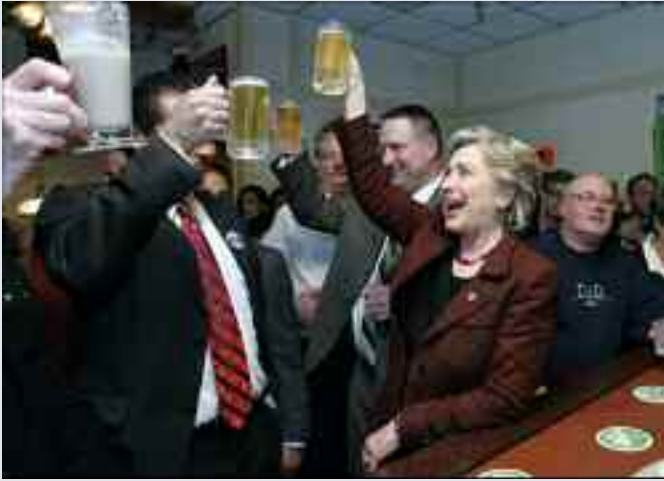
Hillary Clinton enjoying a tasty beverage in Indiana. She is an experienced drinker, and downed more beer than anyone else, especially in key beer drinking states. But the Super Drinkers at the Party changed their tastes.