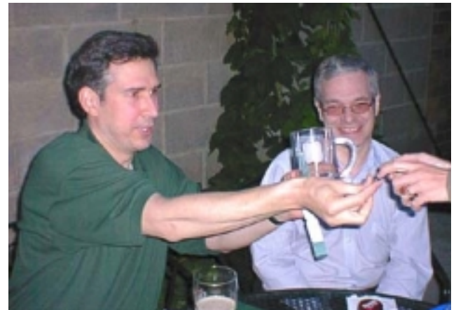
I'll trade you this little piece of paper for that glass.

June 14-24, Mondial de la Bière Montreal, Canada.