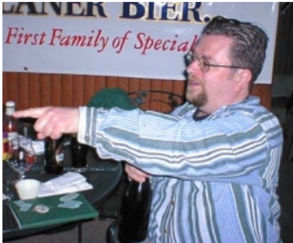
There! There! Over there!