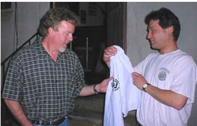
Another T-Shirt finds a home.