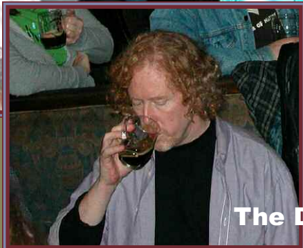
The December '06 MBAS meeting at Mugs