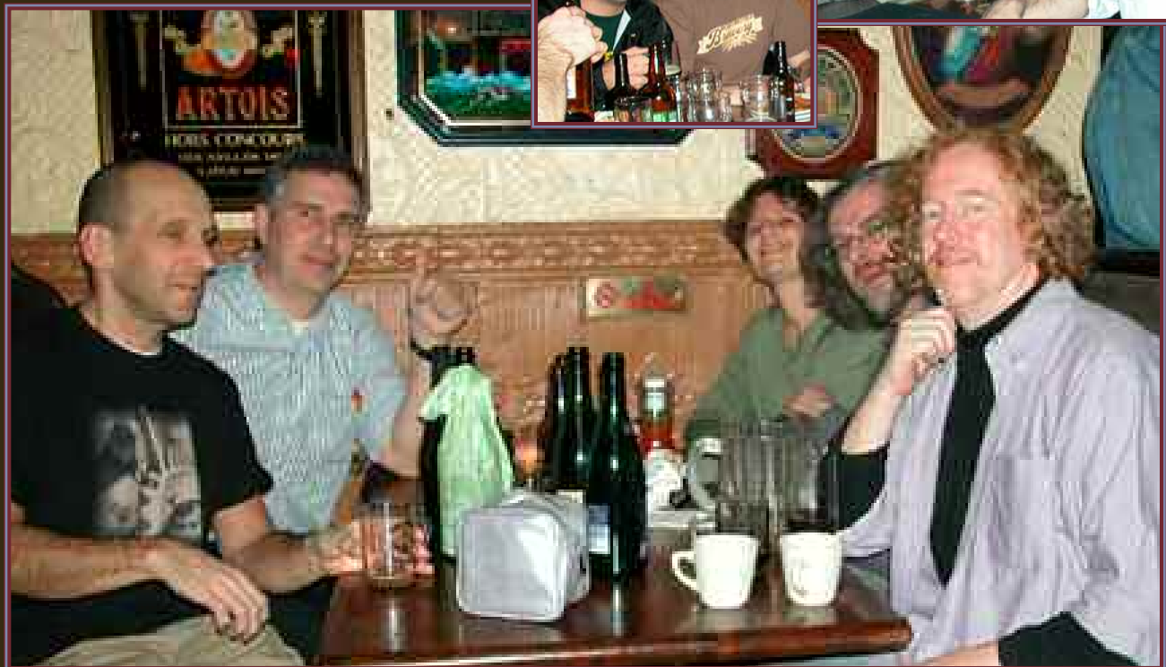
The December '06 MBAS meeting at Mugs